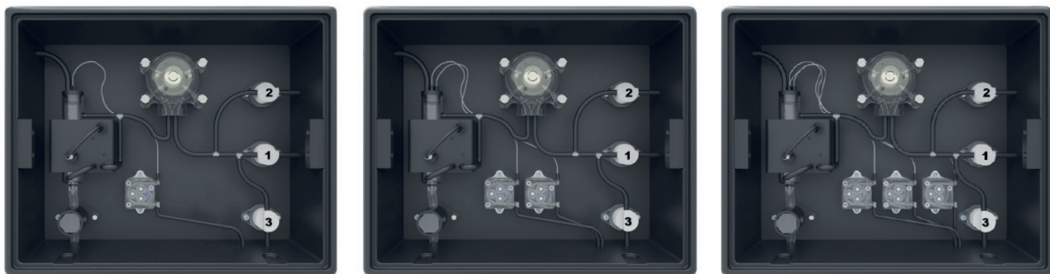
Layout of the wet part of the ICON Analyzer for the addition of 1, 2, and 3 reagents.