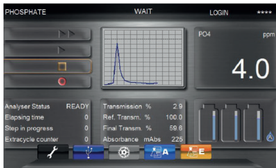
Main analysis screen

Not only will analysis results be logged into the database, alarms can also be managed. For example, an alarm for low reagent levels can appear in the graphical user interface, sent to a control room for further review by the operator, and it can also be logged in the database.