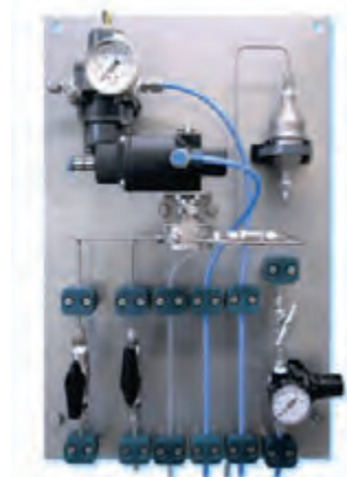
Heavy duty sampling panel

With more than 35 years of experience Metrohm Applikon can provide a complete and exact solution for almost any application. Projects range from one Analyzer in combination with simple sample preparation to complete turn-key packages with shelters, piping, wiring and interfacing. On-site, only the necessary utilities and the sample stream need to be connected, saving a lot of time and energy in the start up phase of the instrument.