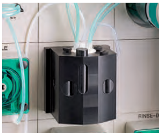
Cuvette LED module