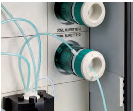
Precision burettes dosing titrants or reagents

Karl Fischer titrations are specific to water content from low level to percent ranges without probe calibration. It is the most selective methodology applied in the petrochemical industry.