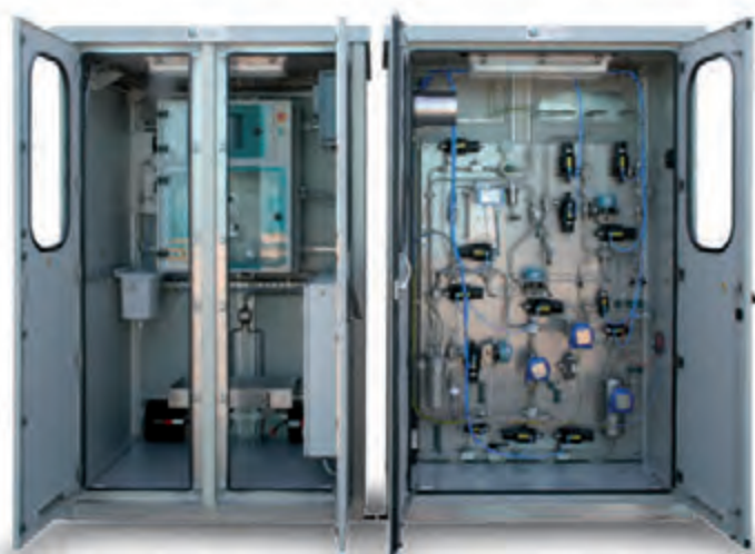
Analyzer shelter with integrated sample preconditioning system