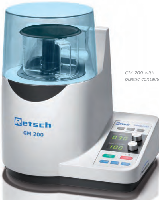
GM 200 with plastic container