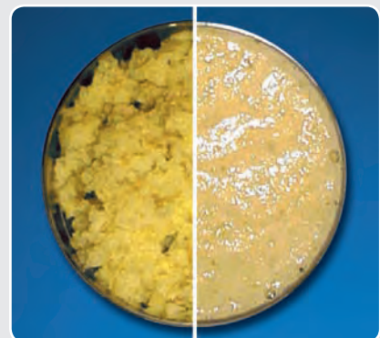
The picture shows a comparison between the degree of size reduction of raw potatoes homogenized with a household mixer (left) and the GRINDOMIX GM 200 (right)